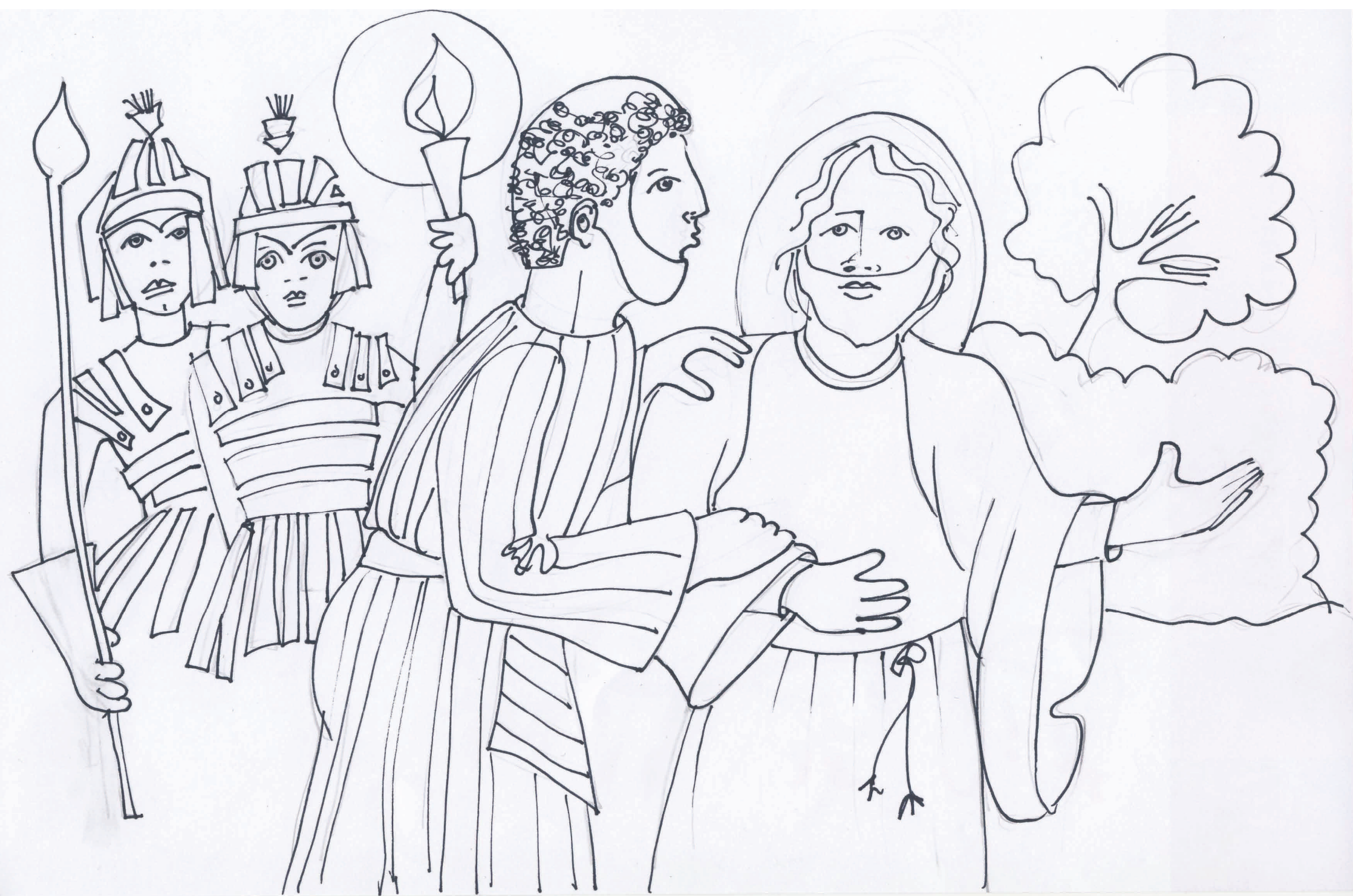
Jesus was betrayed by one of his friends and arrested