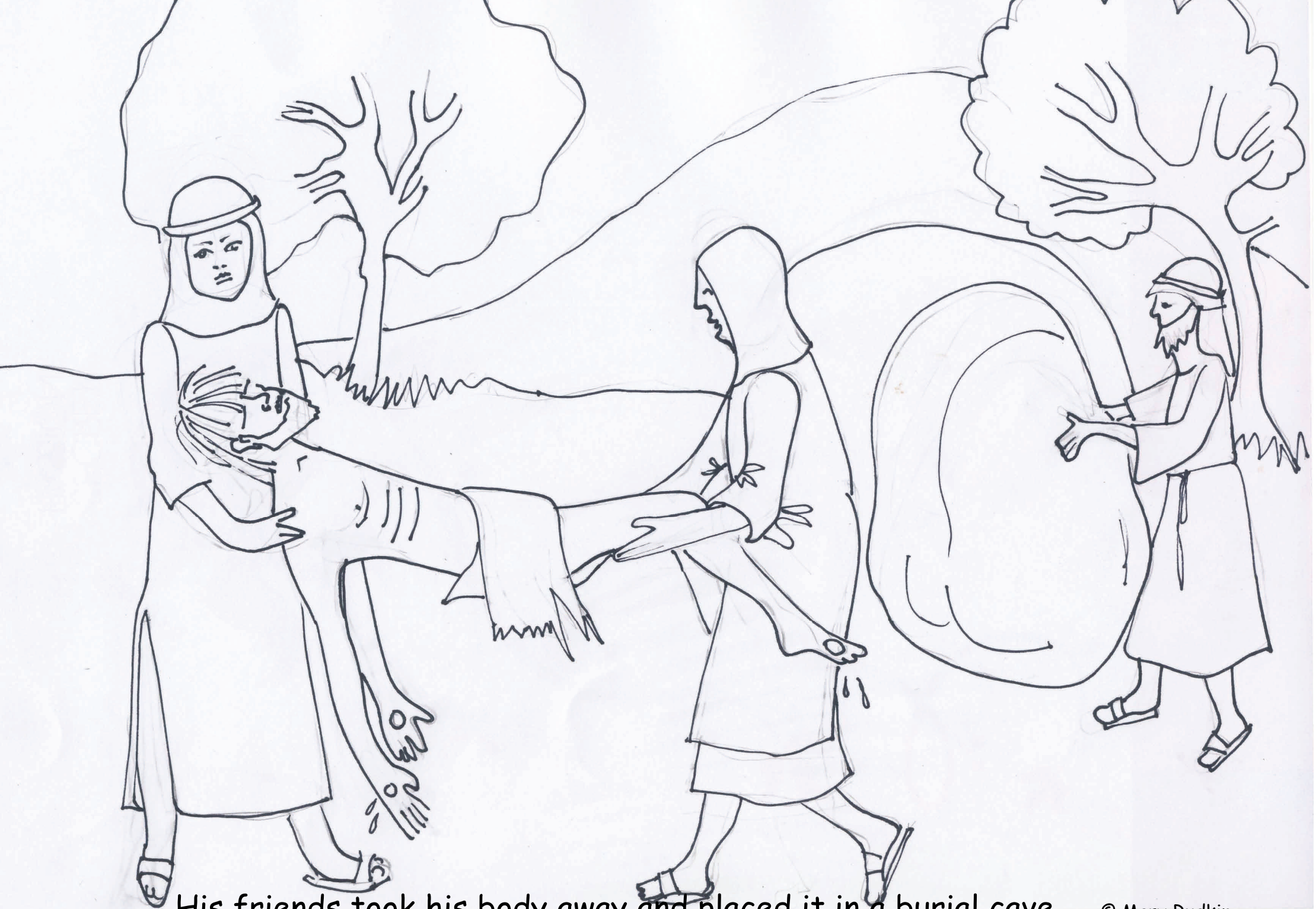
His friends took his body away and placed it in a burial cave