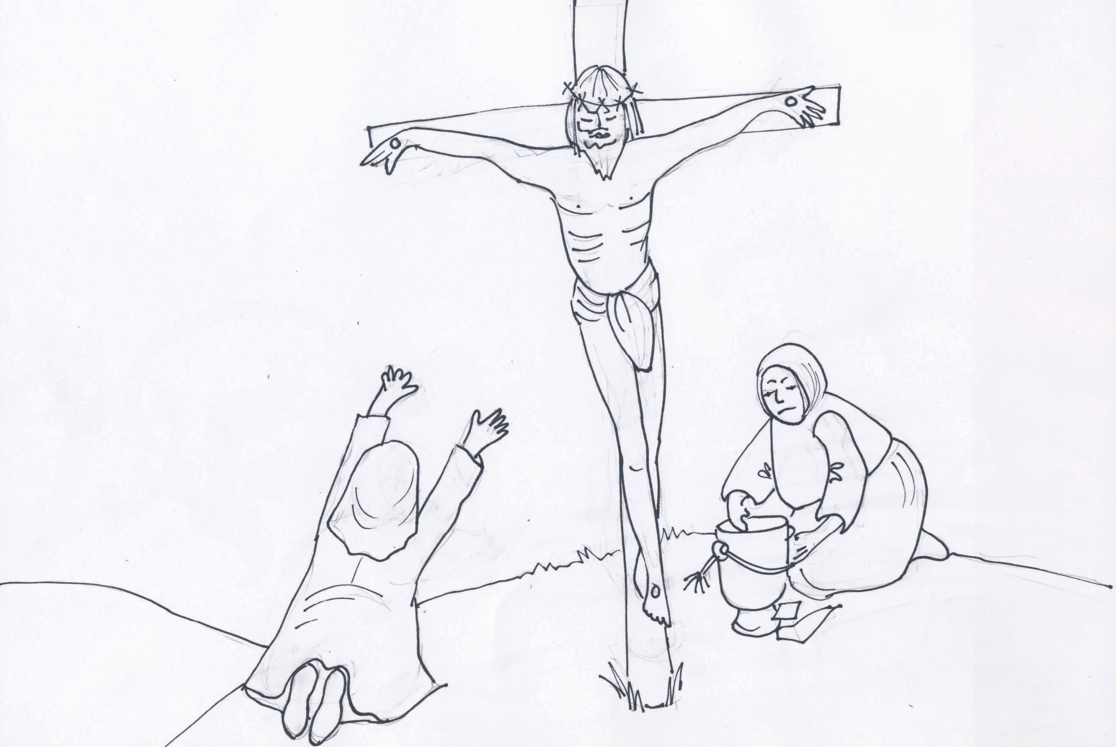
Jesus died on a cross