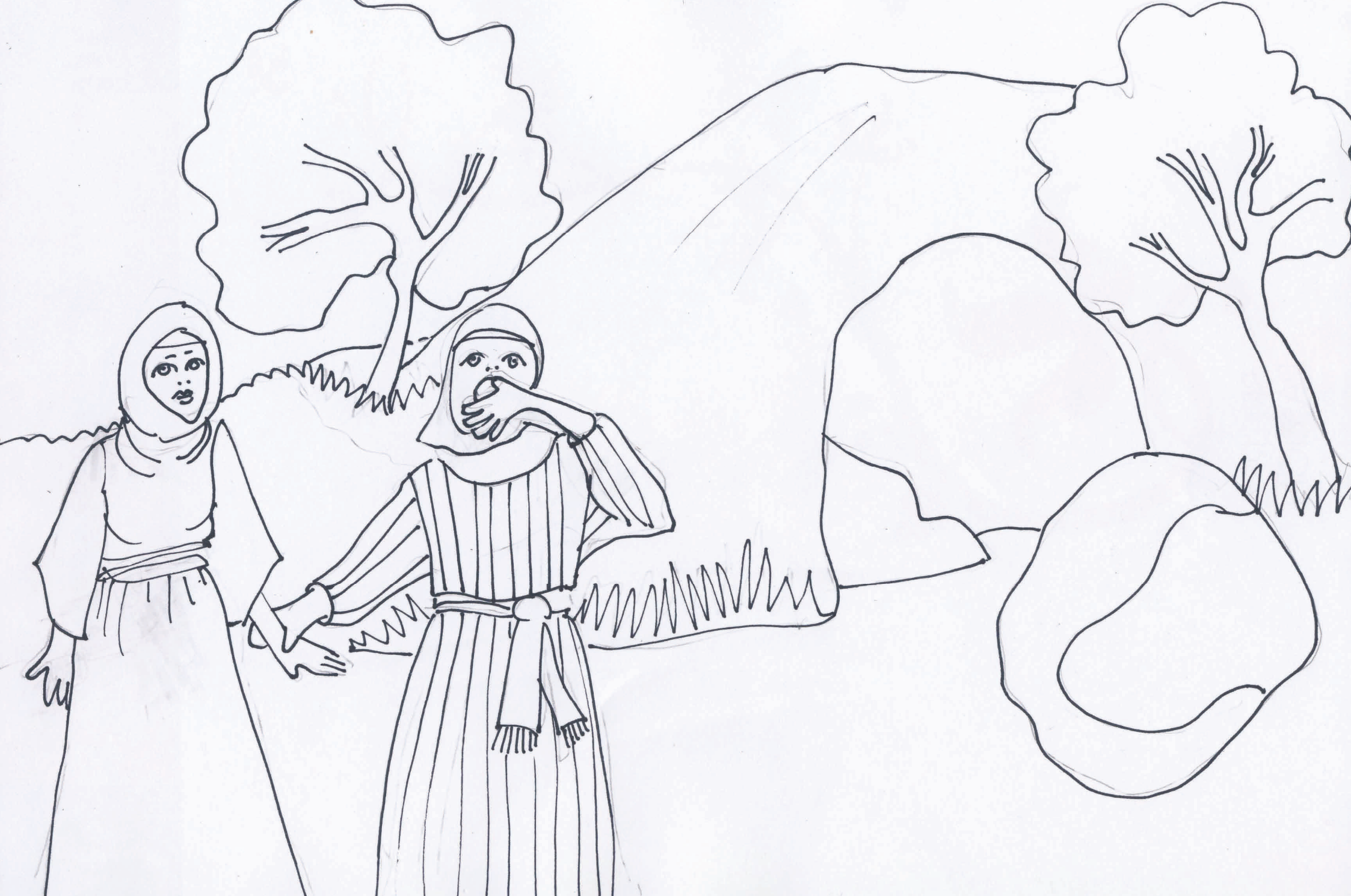
On the third day after his death his friends found the cave was empty. Jesus was alive!