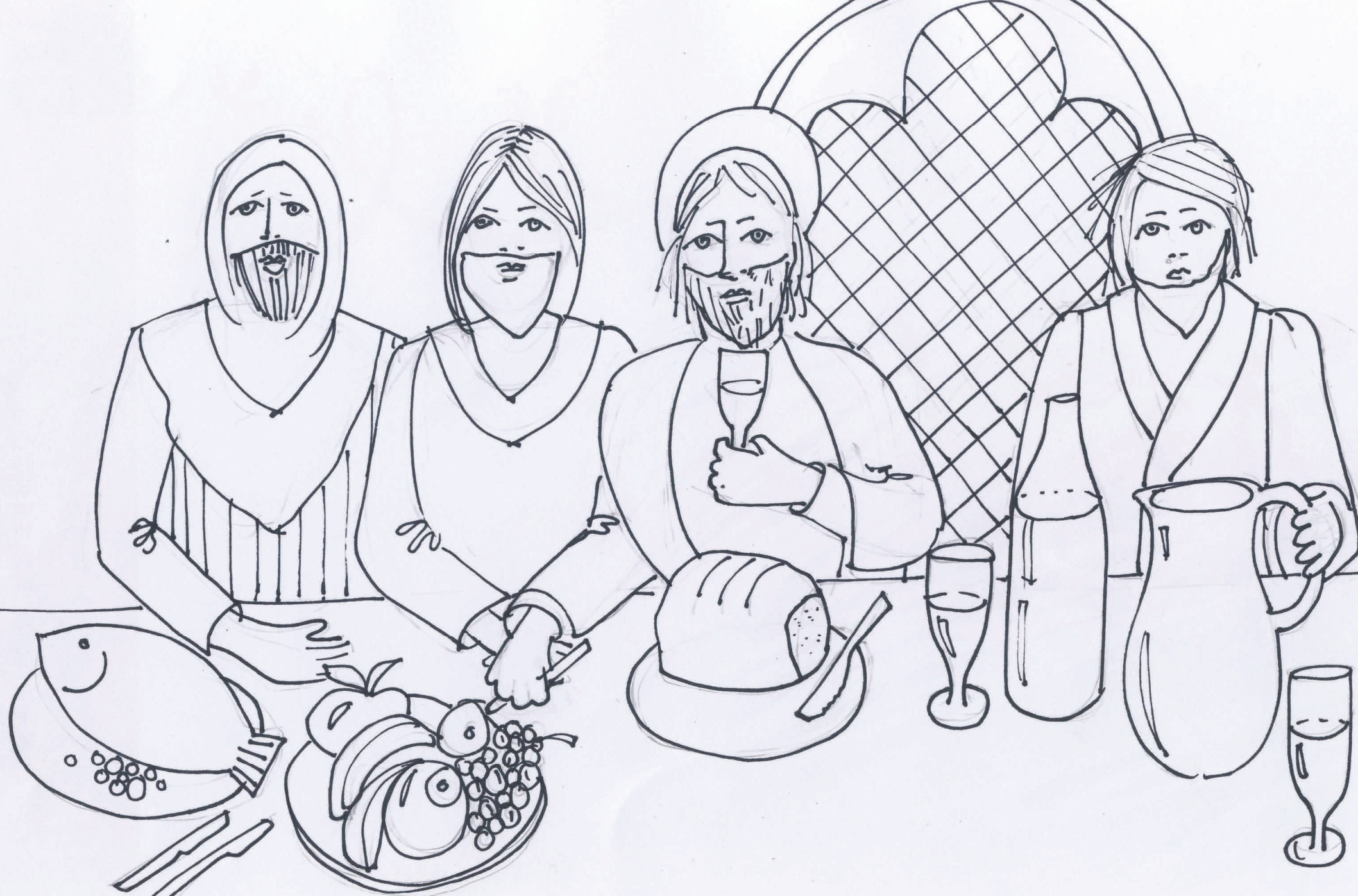
Jesus shared his last meal with his friends